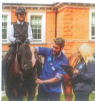
Police horses checked over for National Equine Health Survey, p 512