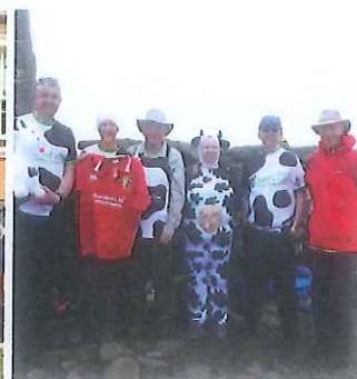
CVOs lend their support to BCVA's 50th anniversary fundraising efforts, p 513