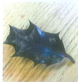
Cases of respiratory distress caused by holly leaf ingestion in lambs, p 547