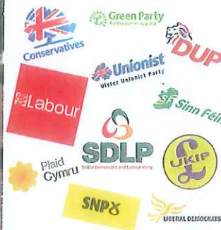
Election manifestos: where does each party stand on animal welfare? p 528