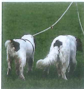
Will Scotland reverse its tail docking ban? p 581

Veterinary Record is published by BMJ Publishing Group Ltd, typeset by Techset, and printed in the UK on acid-free paper from sustainable forests by Warners Midland, Bourne, UK.