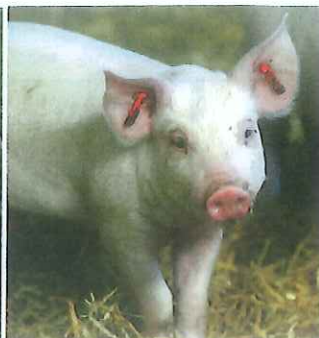
Is marbofloxacin a good candidate for treating pigs in Europe? p 588