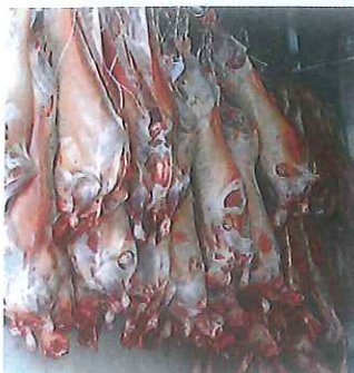
New labelling system proposed for halal meat, p 57