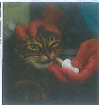
Antimicrobial prescribing patterns in small animal practice in Italy, p 69