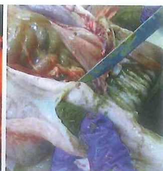
South American camelids are susceptible to rumen fluke, which should be considered in animals presenting with illthrift , p 123