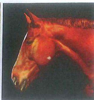
Equine disease surveillance , p 108