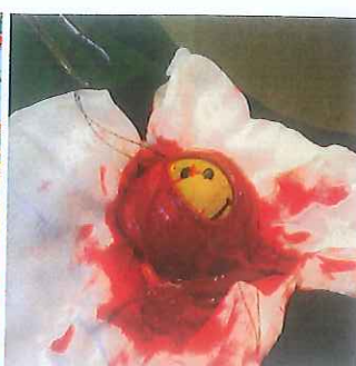
Winning photograph in the 'you and your work' category of the BVA's photo competition, p 225