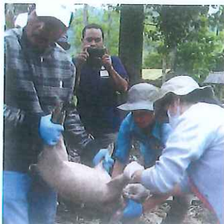
Grant awarded for work on Nipah virus vaccine, p 253