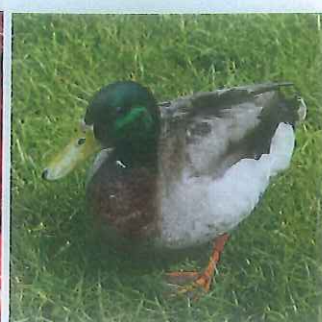
Ducks and the control of liver fluke in sheep, p 270