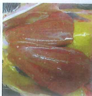
SAC C VS disease surveillance: avian tuberculosis in a hen, p 288