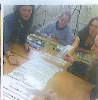
Students learn how to evaluate evidence, p 298