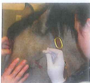
Treating horses presenting with headshaking, p 157