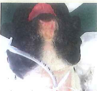
Ethics of justifying invasive procedures on animals with separate pre-existing conditions, p 166