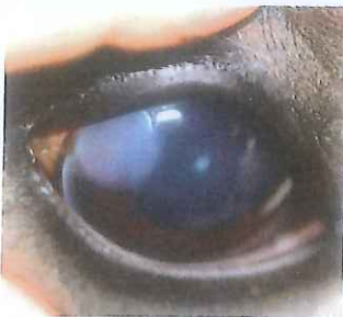
Diagnosing and treating eosinophilic keratitis in horses, p 204