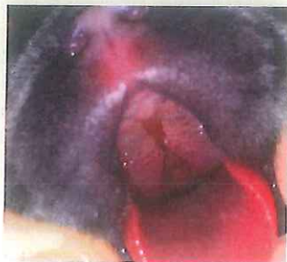
Dealing with a case of cleft palate in boxer puppies, p 214