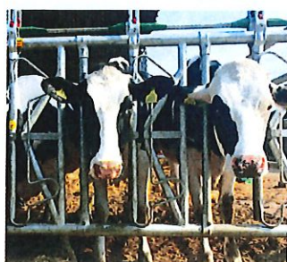
Using big data to drive improvement in cattle practice, p 396