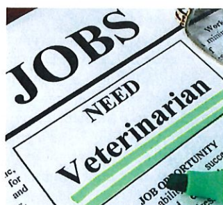
Guide to writing a successful job advert, p 420