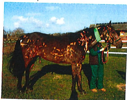
p47 Guide to diagnosing and treating the itchy horse