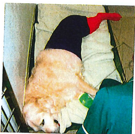
p5 Dealing with cases of haemoabdomen in cats and dogs