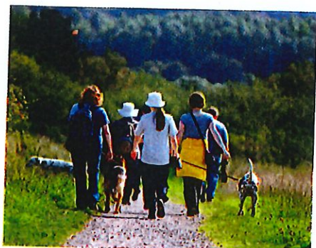
p58 Building a strong brand for your veterinary practice