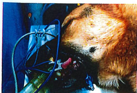
p181 What do you do when you need to perform immediate emergency care on an animal but haven't yet obtained the client's consent?