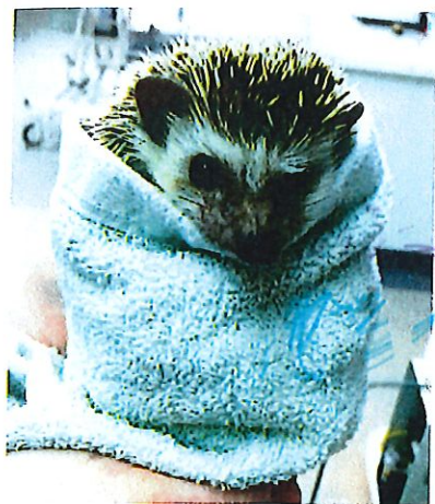
p151 Dealing with pet African pygmy hedgehogs