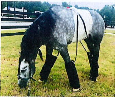
p 510 Diagnosing and treating cases of acute diarrhoea in adult horses